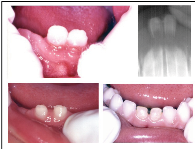
FIGURE 2 - A) Photograph showing a 7-day-old infant with two mandibular neonatal teeth; B) Radiographic examination showing that the teeth were part of a normal primary dentition series; C) Photograph showing a diastema when the baby was six months old; D) Patient with almost all deciduous teeth. Neonatal teeth were yellower than neighboring teeth.

A one-week-old male baby was brought to be examined in our clinic by his parents and two neonatal mandibular central incisors of normal size and color and little mobility were found on examination (Figure 2A). The teeth had been present since the boy was two days old and were therefore diagnosed as neonatal. Radiographic examination revealed that the teeth belonged to the normal series (Figure 2B). His mother reported that the teeth were not interfering with the breastfeeding process. It was decided that the teeth should be left in place and monitored. The mother was instructed to take special care with the baby's oral hygiene, to bring her child back for weekly follow-up appointments and to call if she had any concerns.