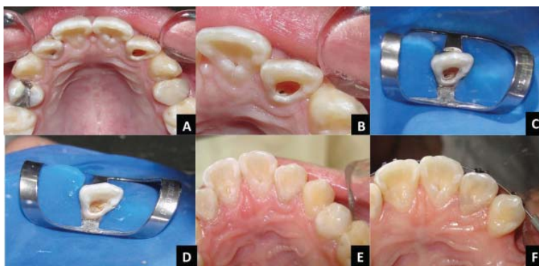
FIGURE 1 – A) Four upper incisors with shovel-shaped crowns and carious cavities in teeth 12, 21, and 22. B) Open hollow area containing a cavity found during clinical examination of tooth 22. C) Rubber dam placed and decayed tissues removed. D) Cavity sealed using glass-ionomer cement. E) Tooth restored using composite resin. F) Patient at 2 years' follow-up.

An open hollow area containing a cavity was found in tooth 22 during clinical examination (Figure 1B). After radiographic examination, the area was found to be as radiopaque as enamel. It extended from the cingulate area toward the root canal and was restricted to a small circle in the crown, corresponding to type I tooth invagination (Figure 2A). No communication was found between the carious lesion and the pulp chamber while inspecting the invaginated area (Figure 2B). Therefore, a restorative treatment plan was developed. Anesthesia consisted of infraorbital nerve block with palatal complementation. A rubber dam was placed, and decayed tissues were removed (Figure 1C). After gaining access to the invaginated area, the cavity was sealed with Vitremer® glass ionomer cement (3M® ESPE, St. Paul, MN, USA) (Figure 1D). A periapical radiograph was obtained to confirm sealing of the invagination (Figure 2C). Subsequently, the tooth was restored using EvoluX composite resin (Dentsply™, Maillefer). The rubber dam was then removed and occlusion was verified (Figure 1E). The patient was followed for 2 years. After this period, clinical (Figure 1F) and radiographic (Figure 2D) findings evidenced treatment success. The preservation of the pulp vitality was verified through the vitality test. An absence of pain, fistulas, swelling and periodontal pockets were also verified.